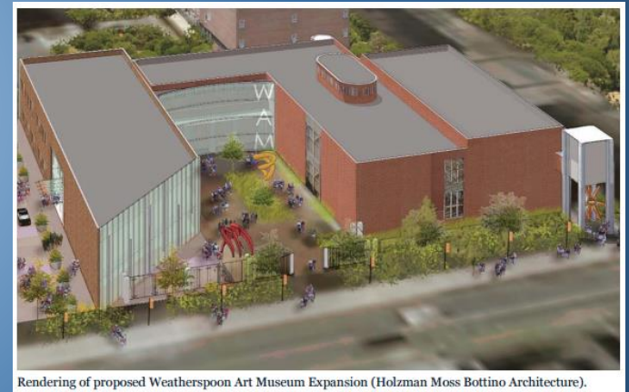
Rendering of proposed Weatherspoon Art Museum Expansion (Holzman Moss Bottino Architecture).